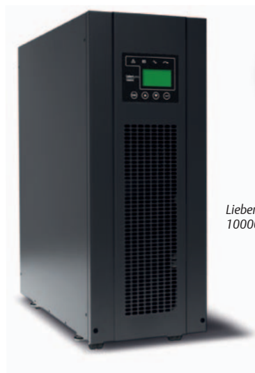
Liebert GXT3 10000 VA Tower